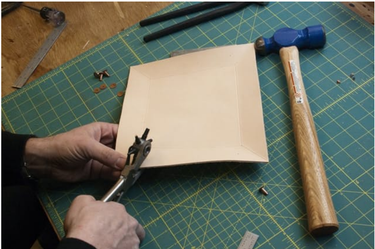
Figure out where to place the rivets. Just remember, the rivets will actually pinch and hold the leather together about an 1/8 inch beyond the edge of the rivet head. If you've never worked with rivets before, buy a few extra and practice on a scrap piece of leather before you do this step.