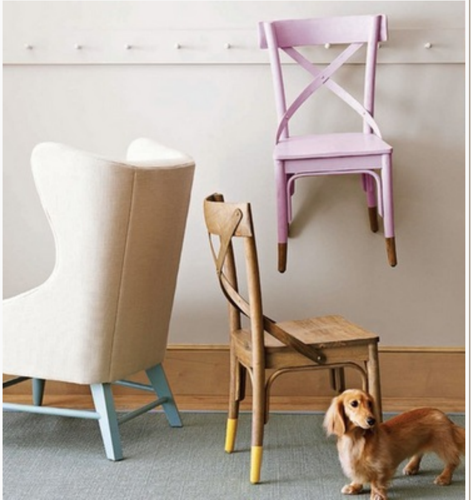
found via pinterest