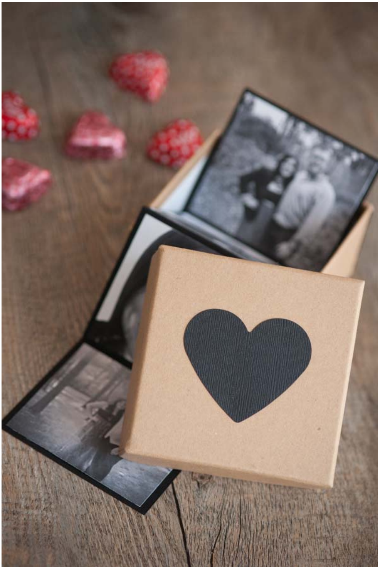
[Design + styling by Cyd Converse for The Sweetest Occasion. ]