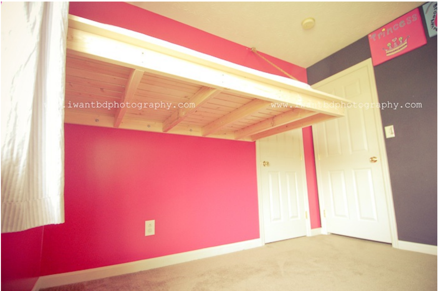
...which led us to finish the room with a glamping theme {girly glamorous camping}