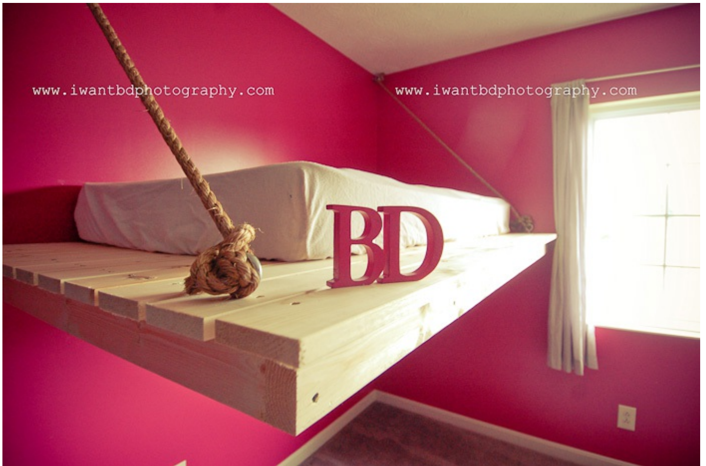
these beds are soooo adorable. they remind me of camp bunks...