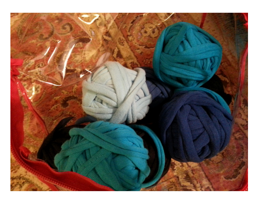
Step 4. Crochet. I used a single crochet here for a dense weave. I don't know the name of the method I use, but I twist the yarn onto my hook, chain 2, then SC my first round. You can also start with a magic circle, or any other method to start crocheting in the round. For an crash course in crochet, start here with my lovely friend Rachel!

I started with 6 SC in the first round, doubled it to 12 in the second round, and slowly increased beyond that. In retrospect, I think I should have started with 4, doubled to 8, and then actually counted my way around.