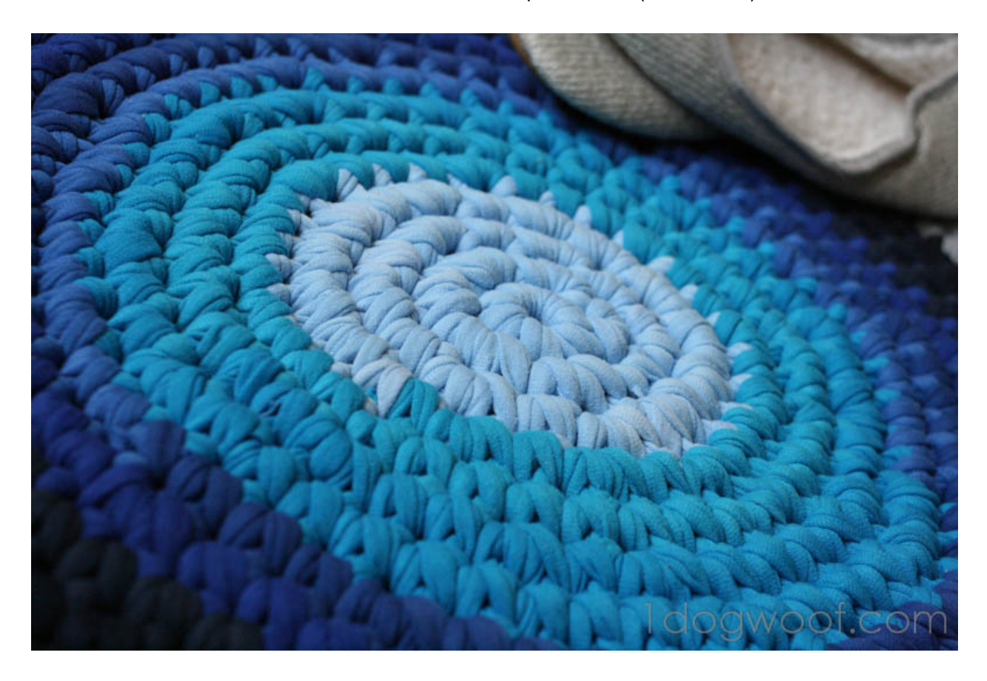
4th round: * 1 SC in next 2 stitches, 2 SC in next stitch, repeat form * (16 stitches) and so on.

Or, you can be like me and just make it up as you go, increasing as necessary to keep the piece flat. If the work is curling up, you need more stitches in the round. If the work is ruffling, you can either take it apart and not increase as many stitches, or do a round with no increases, sort of to bound the problem. I also tried to alternate where I made the increases so as to keep a circle shape. I've noticed that if I increase in the same spot each round, I end up with a polygon instead of a circle because of the bulge that extra stitch makes.