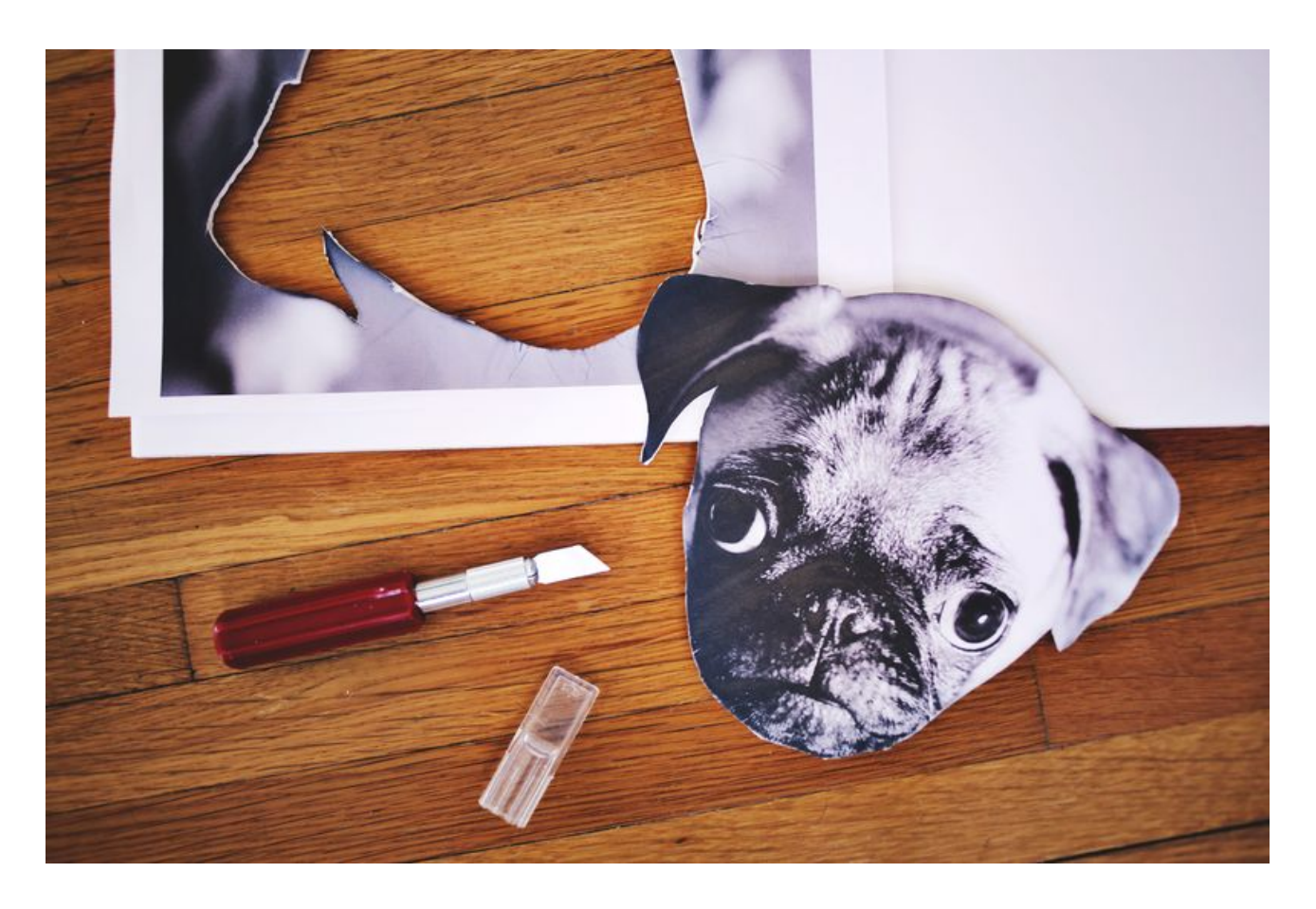
Step 2. Once printed, glue your photo onto some foam board that is at least an 1/8-inch thick and use an X-Acto knife to cut out the face.