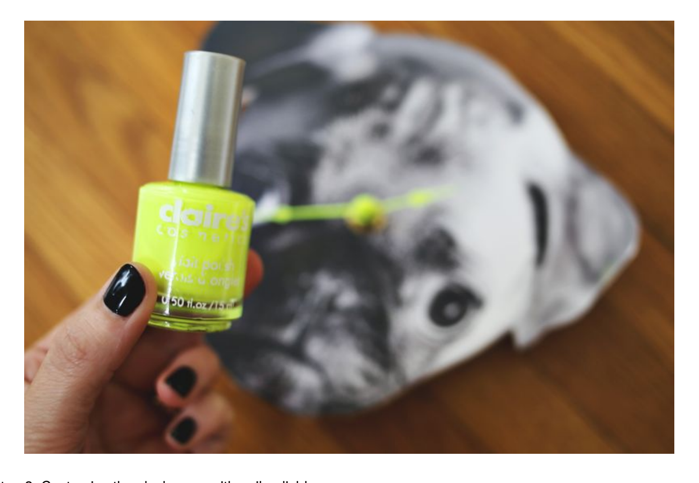
Step 3. Customize the clock arms with nail polish!