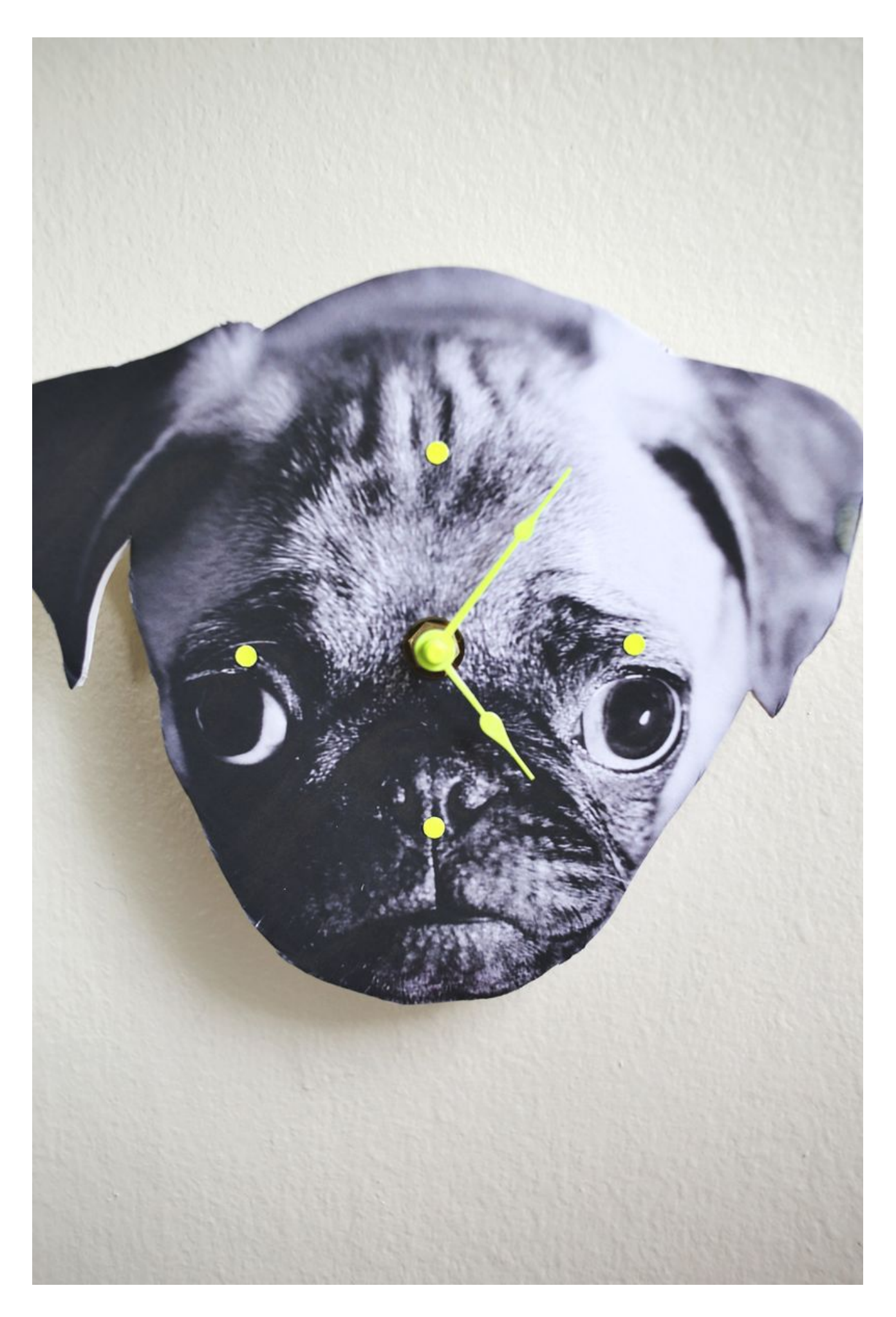
I don't know why, but I always had the impression that making a DIY clock would be really tedious and stressful. Boy was I wrong! This cute, customized photo clock is simple to make in about an hour. Really! It's that easy.