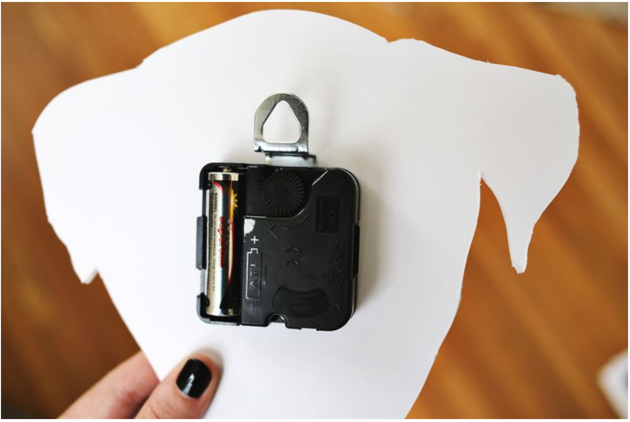
Step 4: Assemble the clock. Cut a small hole in the middle of your pet's face and follow the instructions to mount your clock kit (you are just inserting your pet's face where the clock face would usually go). Cut out four small paper dots and glue the dots onto the clock to indicate the noon, three, six, and nine o'clock positions.