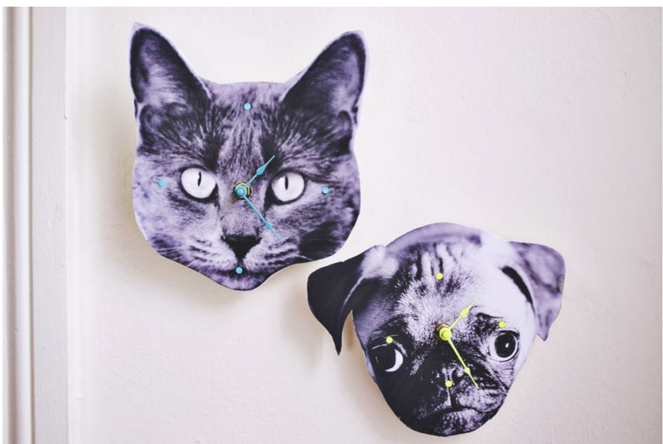
All done! Isn't it the cutest? You can use any photo to create this fun and easy clock. These make great gifts! Do you think you'd enjoy making your own?