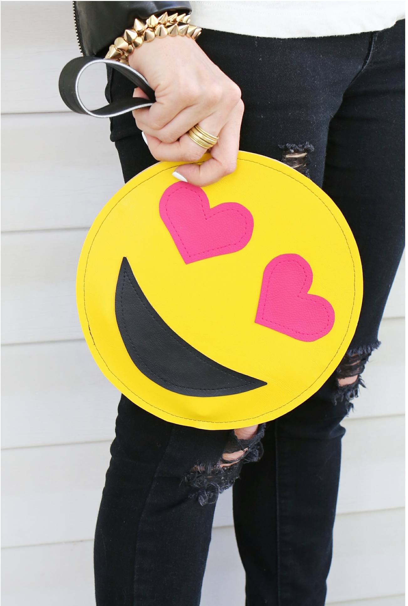
OMG! I want one! Emoji clutch DIY (click through for tutorial)