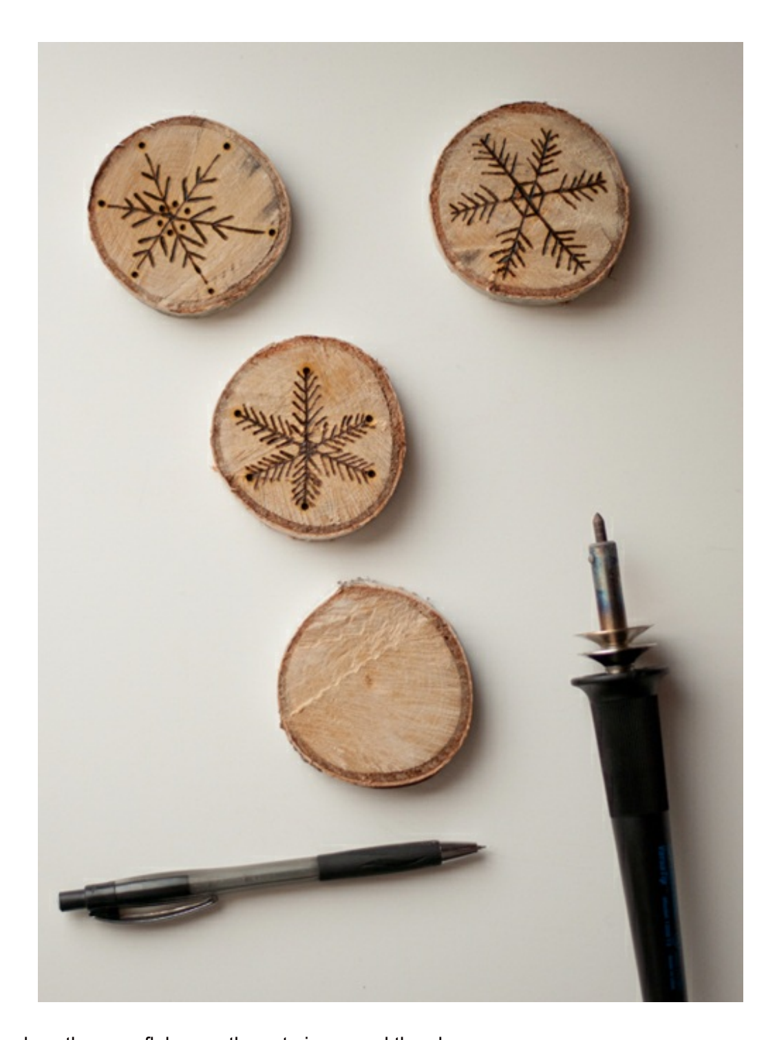
Use a pencil to draw the snowflakes on the cut pieces and then burn away.