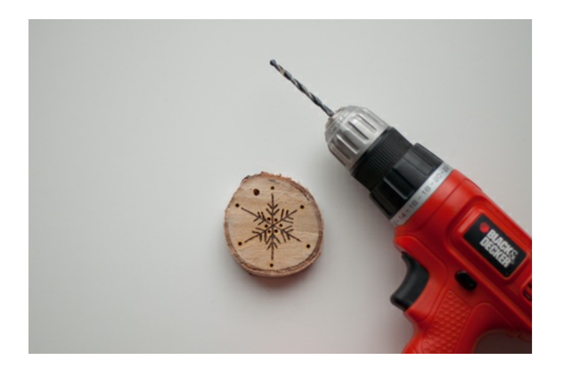
When the flakes are done, use the drill to make a hole for a ribbon.