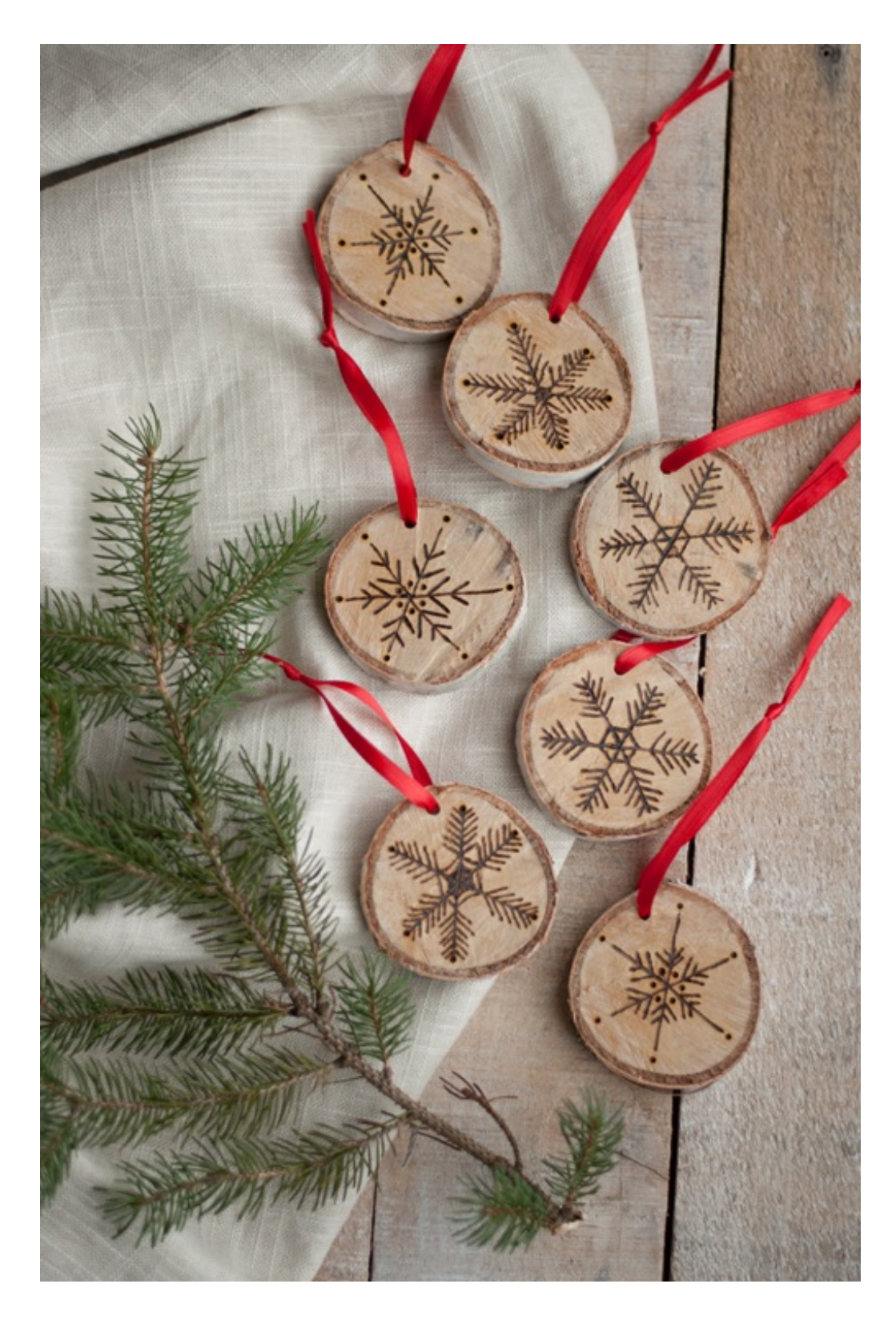
And that's it. Easy as pie. Just be sure to slice up plenty of birch, because these are so fun to make, you won't want to stop. Speaking of which, don't stop with snowflakes! You could etch any design you like. Wouldn't a monogram be fun?