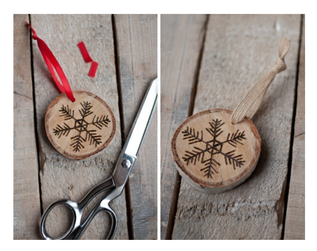
And finally, add the ribbon or twine to hang, and they are ready for the tree or gift topper. The red ribbon adds a very Christmas-y pop of color, but if you like a really natural tree, twine would keep the palette neutral.