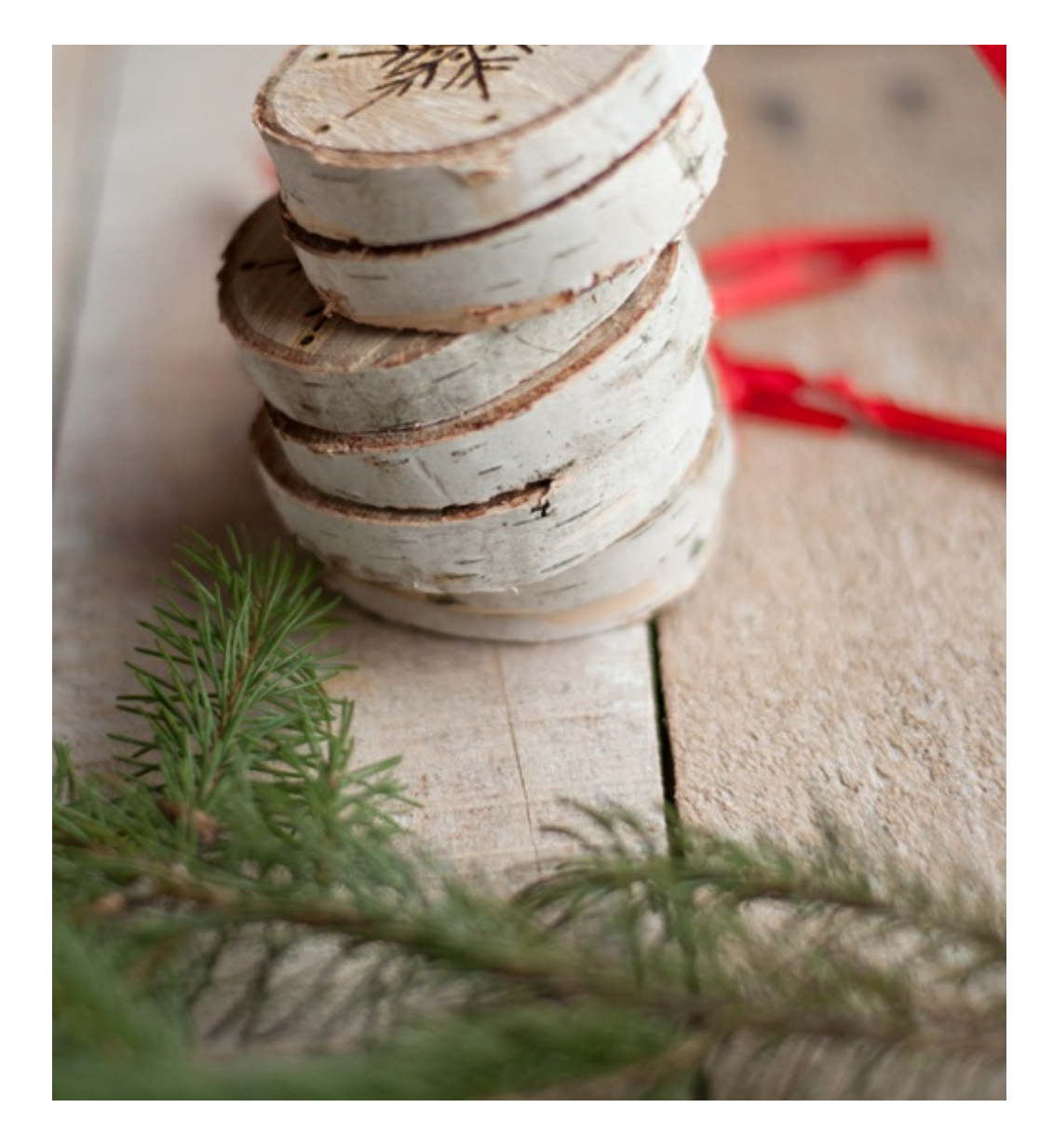
The interior of the birch branch was soft so etching was very easy and the process was very quick.