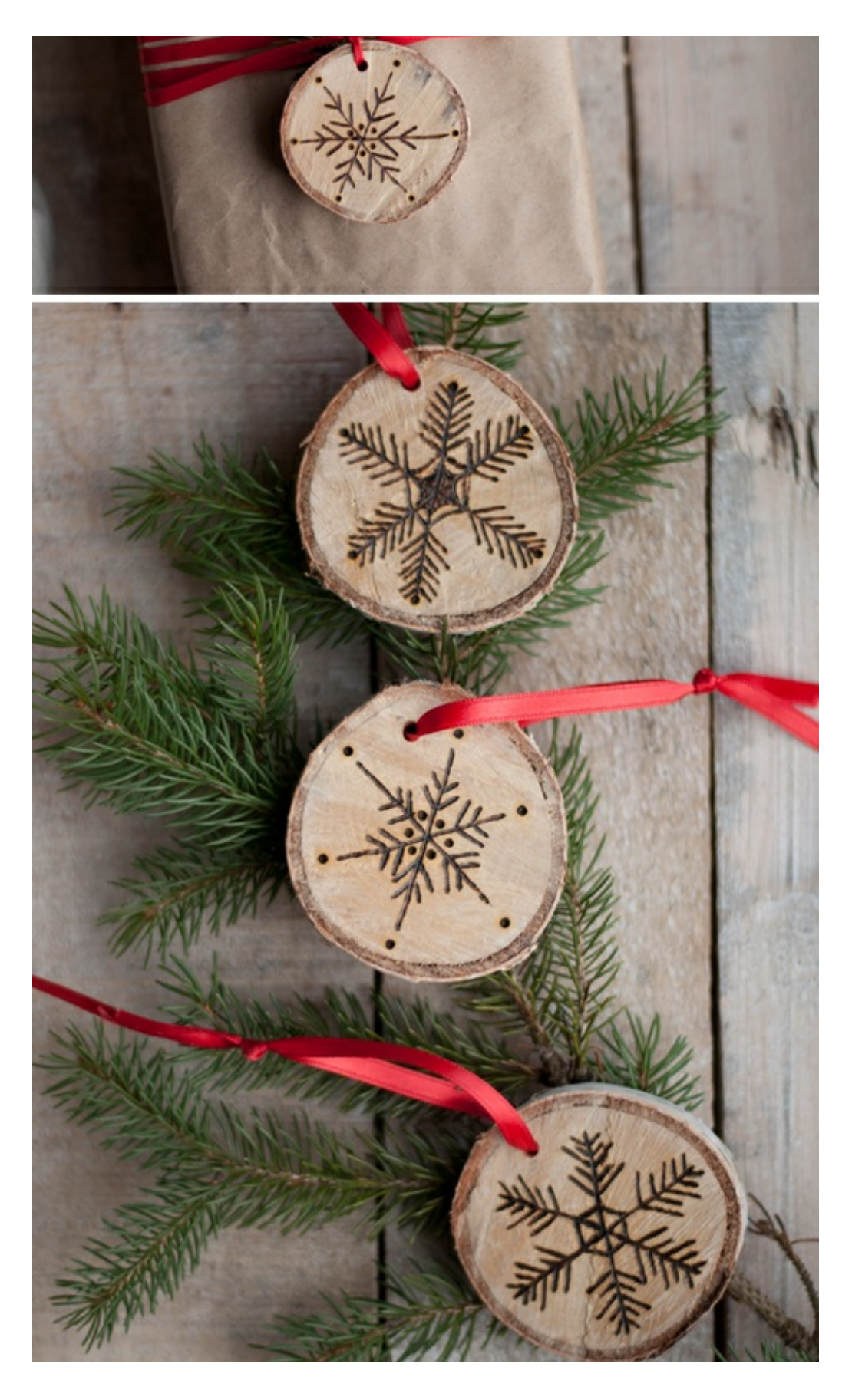
Flex those fingers and let's do this.