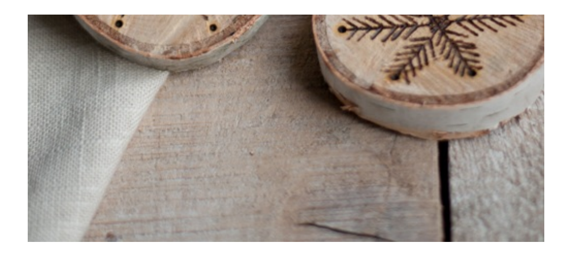
Don't worry if drawing snowflakes isn't your thing — feel free to copy mine! The designs I made are totally easy and simple to mimic.