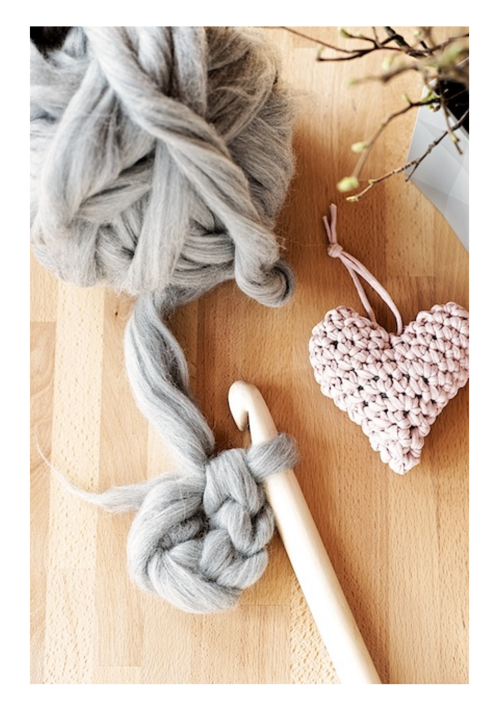
Rnd2 and all following rounds: alternate 1 single crochet in next 2 , 2 single crochet in next... repeat until you can count 24 stitches all around.