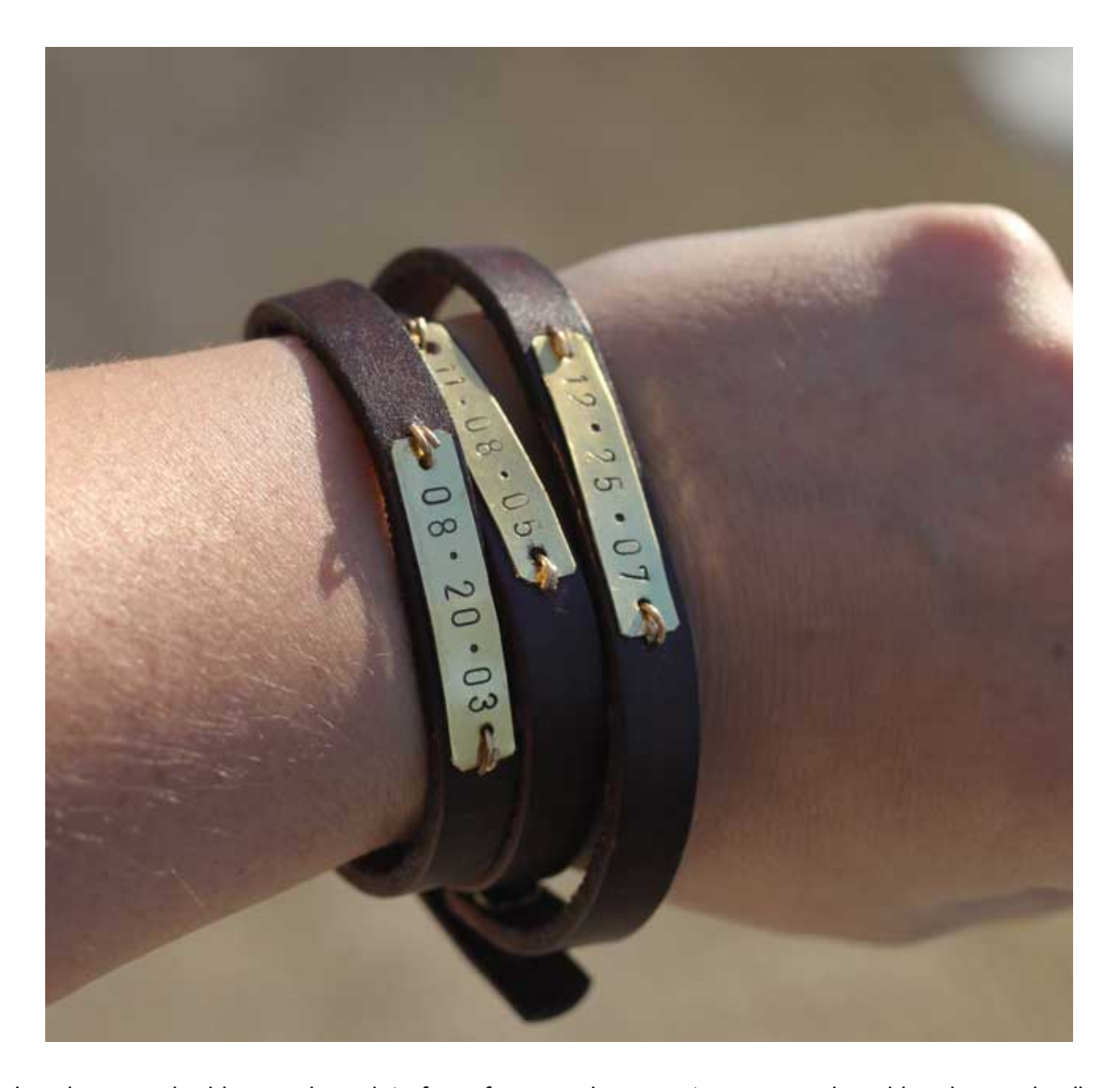
Then I made some double wrap bracelets for a few people on my team, some in gold and some in silver.