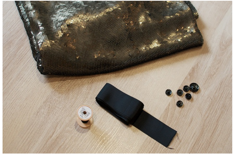
Click below to read more!

I've wanted to make a sequin maxi skirt for quite some time but haven't had time to spend carefully sewing all the edges. Luckily I stumbled upon instant bonding fabric tape, which acts like double sided tape but had the necessary stretch for fabric. Usually I wouldn't be into these quick fixes (preferring to sew where possible) but this one seemed too good not to try with tricky sequins, and so I used it to finish the hems and side edges. If you have more time I definitely encourage machine or hand sewing the edges of your skirt so it lasts longer, but if you're working to a New Years Eve deadline, bonding tape might be just the ticket!