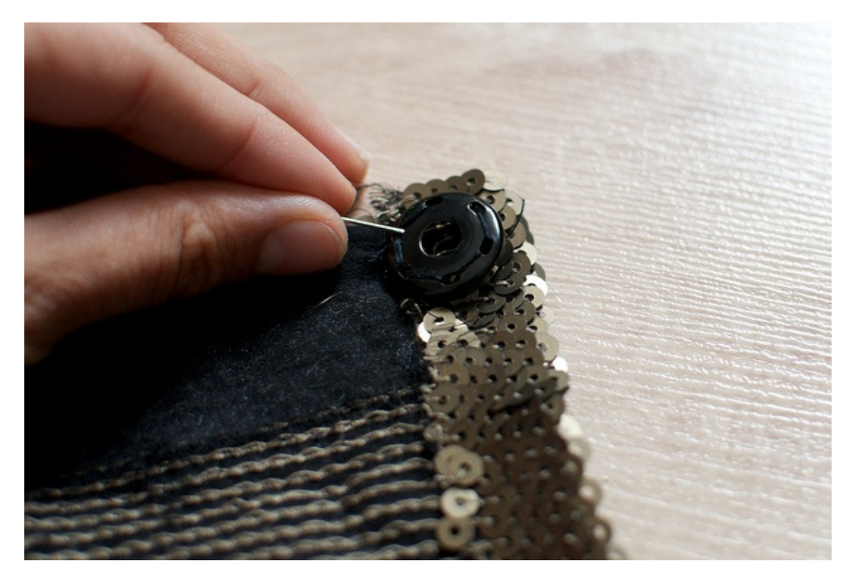
9. The back of your skirt waistband should look like this once it is done, with one side sitting over the top and one on the underside, both button down nicely.