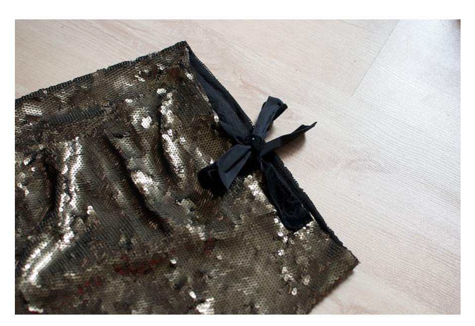
And there you go! Such a simple piece for party celebrations, I love pairing mine with a silk midriff top or slouchy singlet and simple black flats.