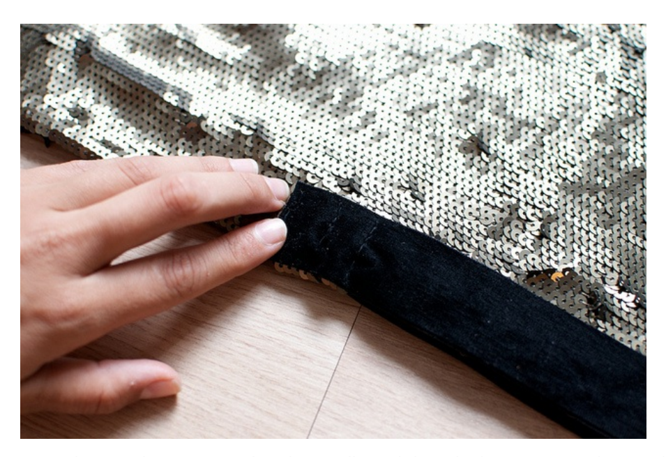
8. Sew the snap buttons on using the needle and thread. The pattern at the top shows where I put the buttons, but it is indicative and the easiest way to check where the buttons should go is by putting the skirt on, tying the velvet ribbon and using pins to mark where the buttons should attach on both top ends of the fabric. Make sure to sew the buttons the right way up so they press together properly.

7. Each side of the velvet ties should look like this. I sewed a few lines to reinforce the two pieces.