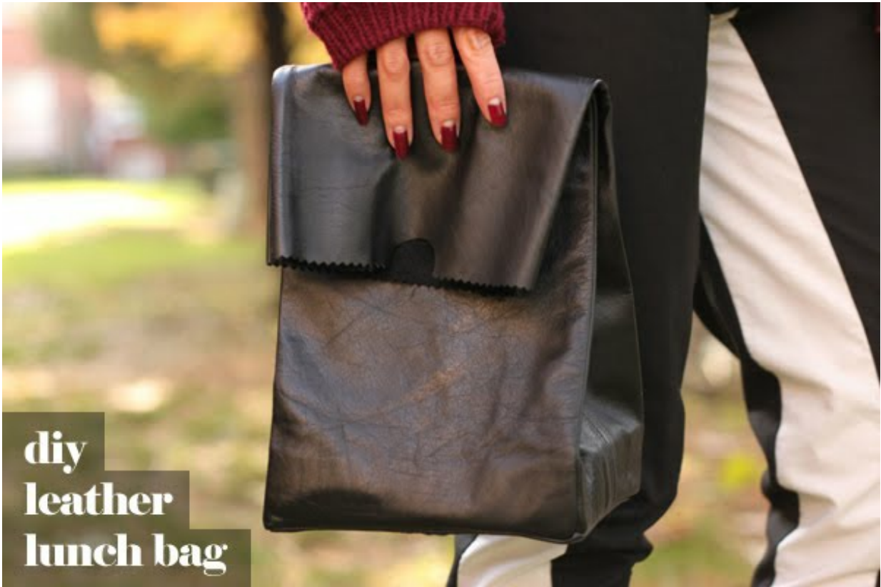
diy leather lunch bag