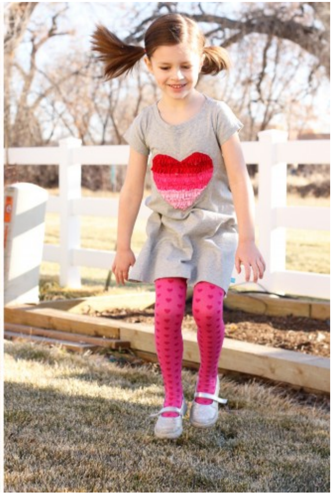
This girl loves purple and pink equally. So that big ruffly heart made her grin.